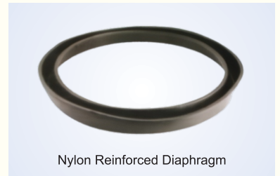
Nylon Reinforced Diaphragm