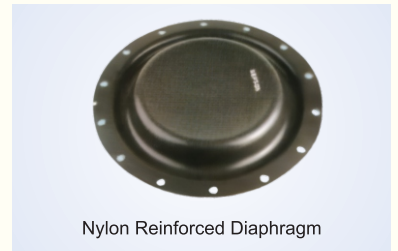
Nylon Reinforced Diaphragm