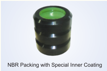
NBR Packing with Special Inner Coating