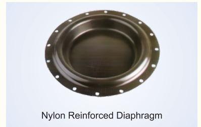
Nylon Reinforced Diaphragm