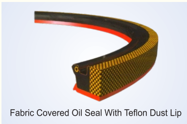
Fabric Covered Oil Seal With Teflon Dust Lip