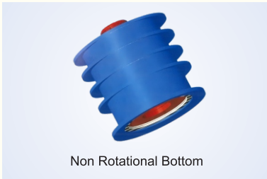
Non Rotational Bottom