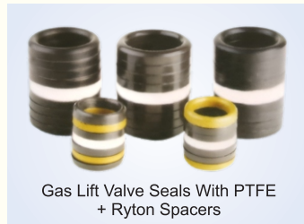
Gas Lift Valve Seals With PTFE + Ryton Spacers