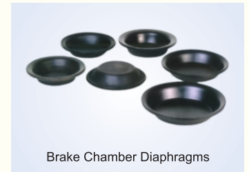
Brake Chamber Diaphragms